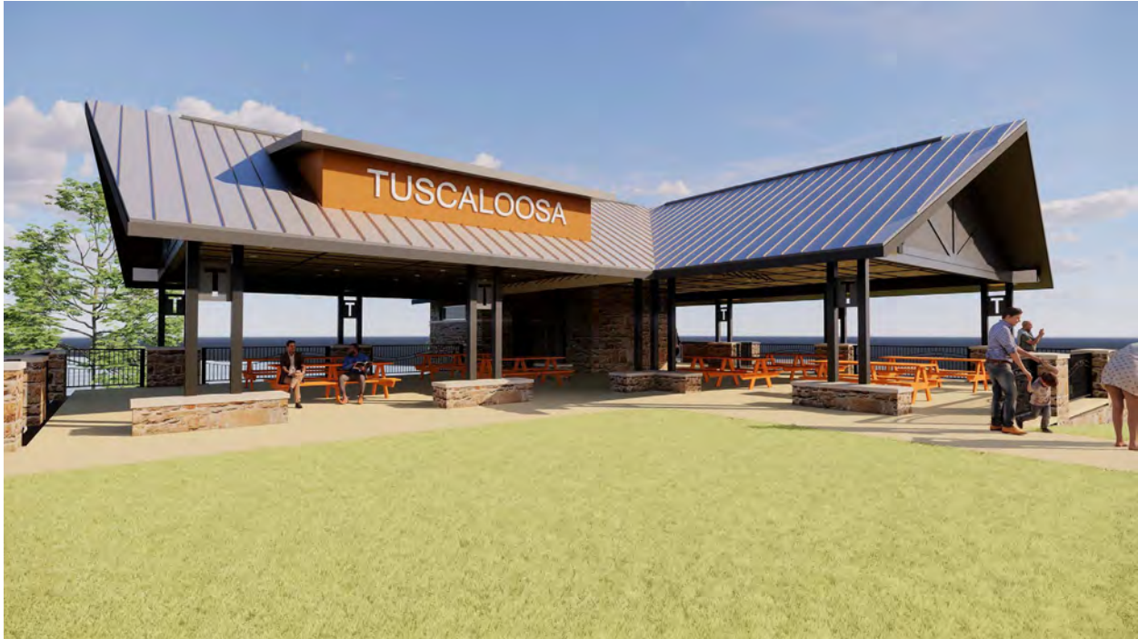
Conceptual Rendering Only