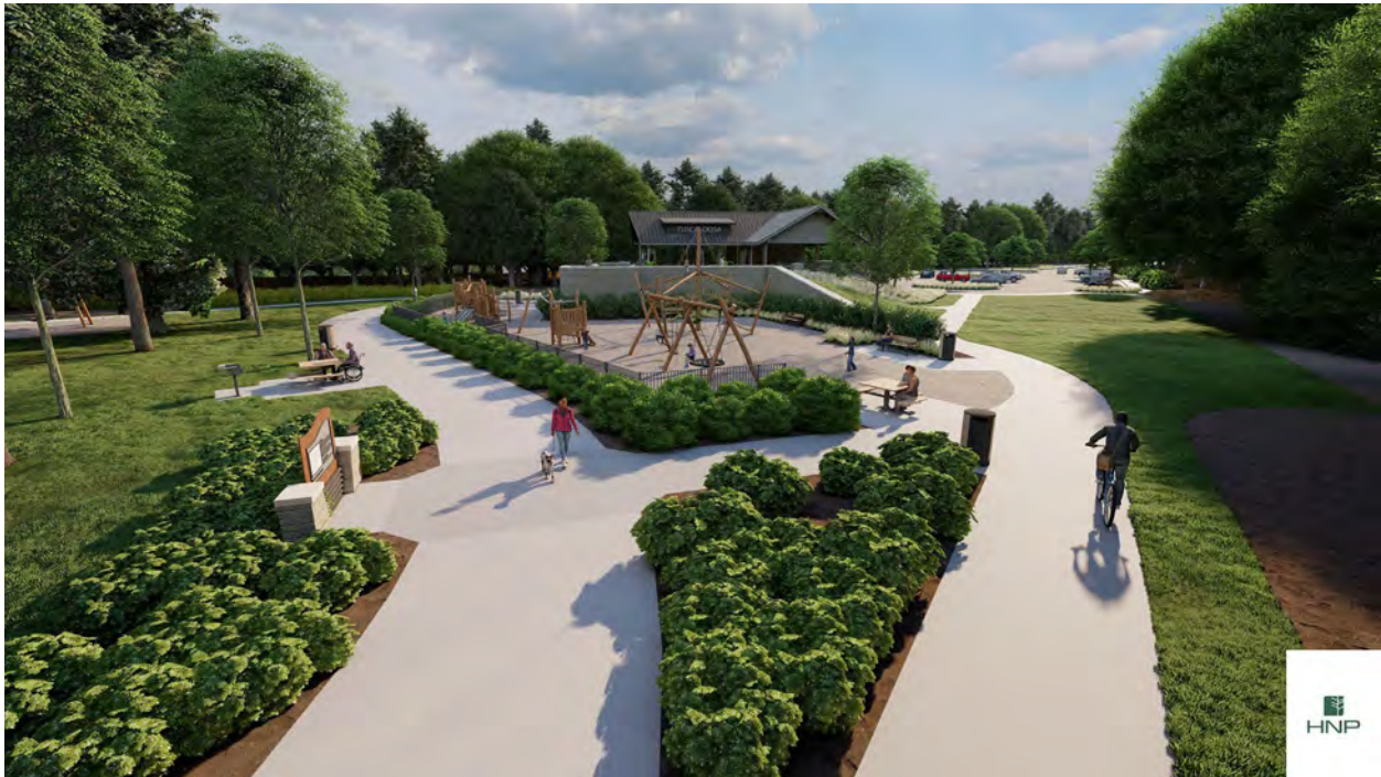
Conceptual Rendering Only