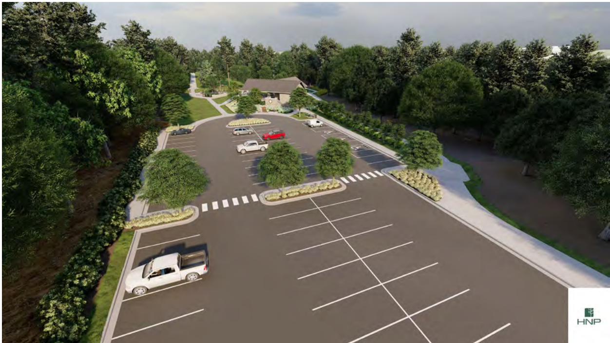
Conceptual Rendering Only