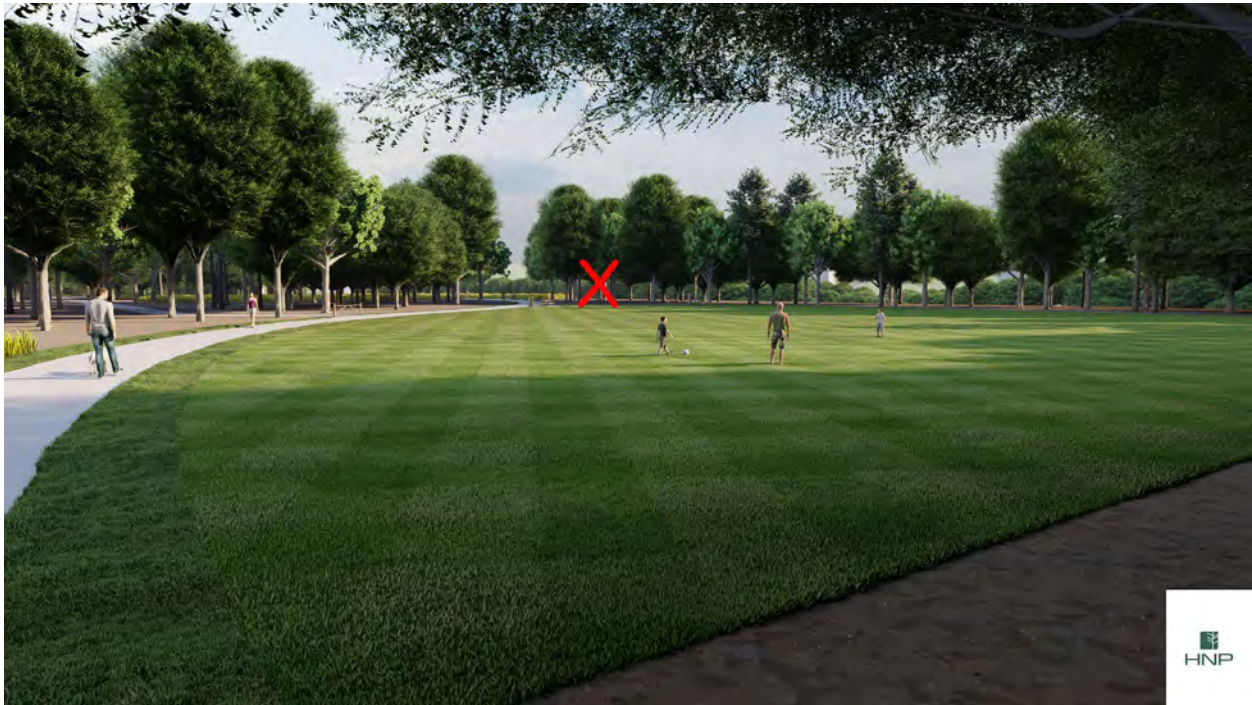
Conceptual Rendering Only