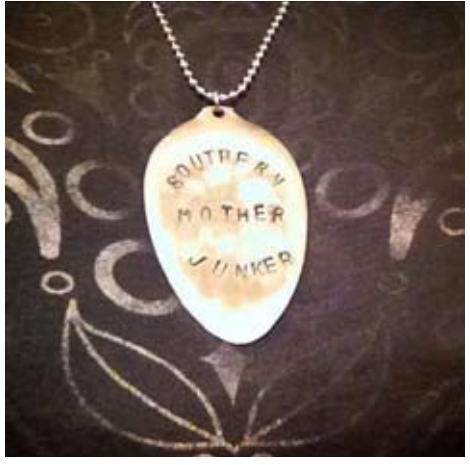
From bamboo salsa by Black Belt Bamboost to hand-made jewelry, the 5th Street Market has something for everyone.