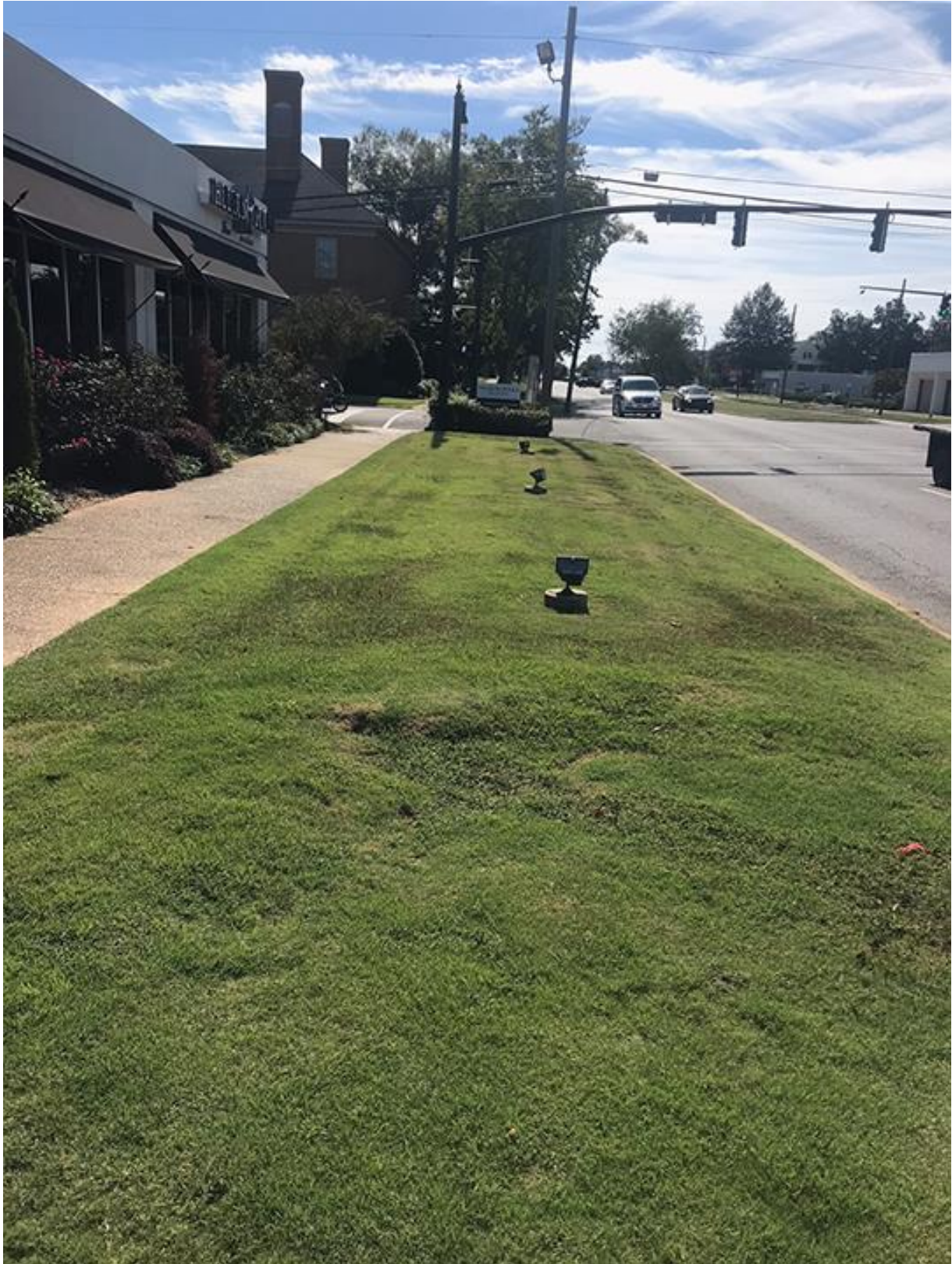
Ground site: looking south