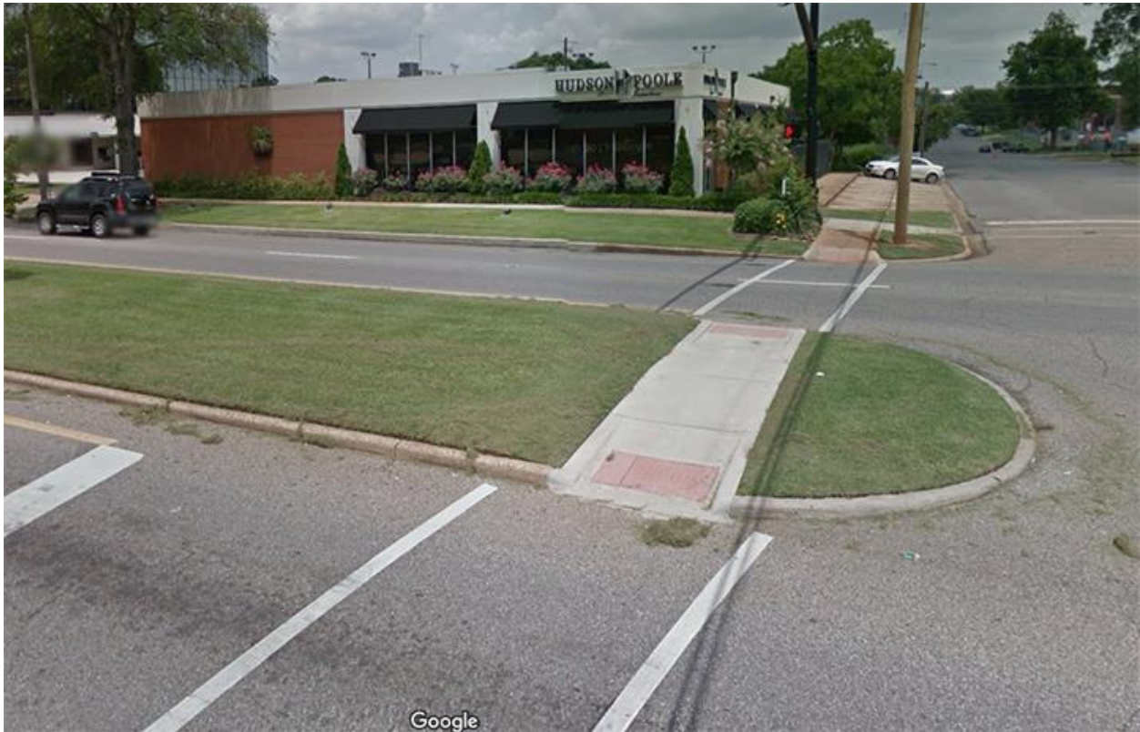
Hudson-Poole fine Jewelers from NW corner of Greensboro Ave. & 12 th St.