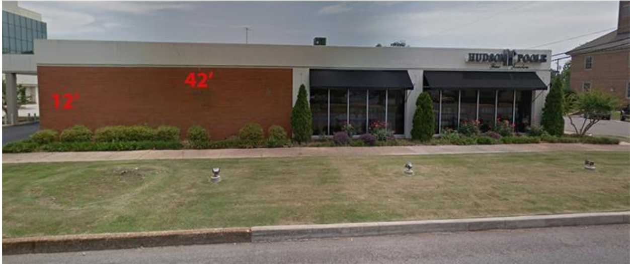
Site: wall dimension 42' length x 12' height