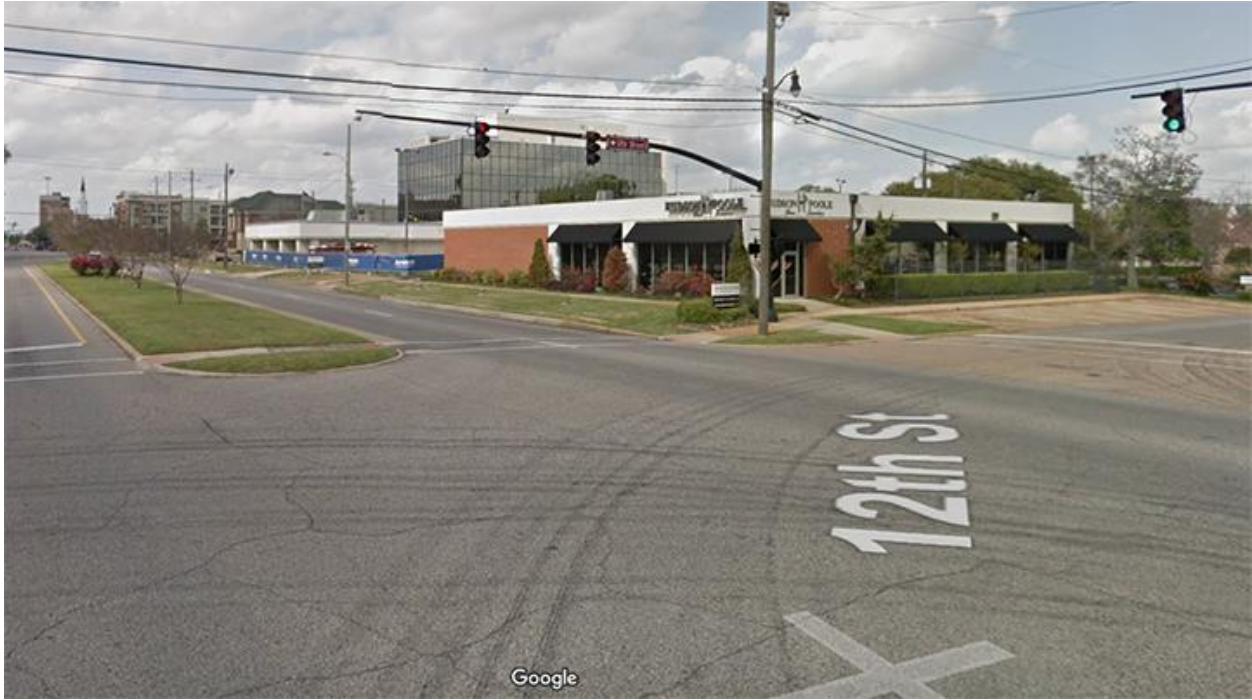
Hudson-Poole Fine Jewelers from SW corner of Greensboro Ave. & 12 th St.