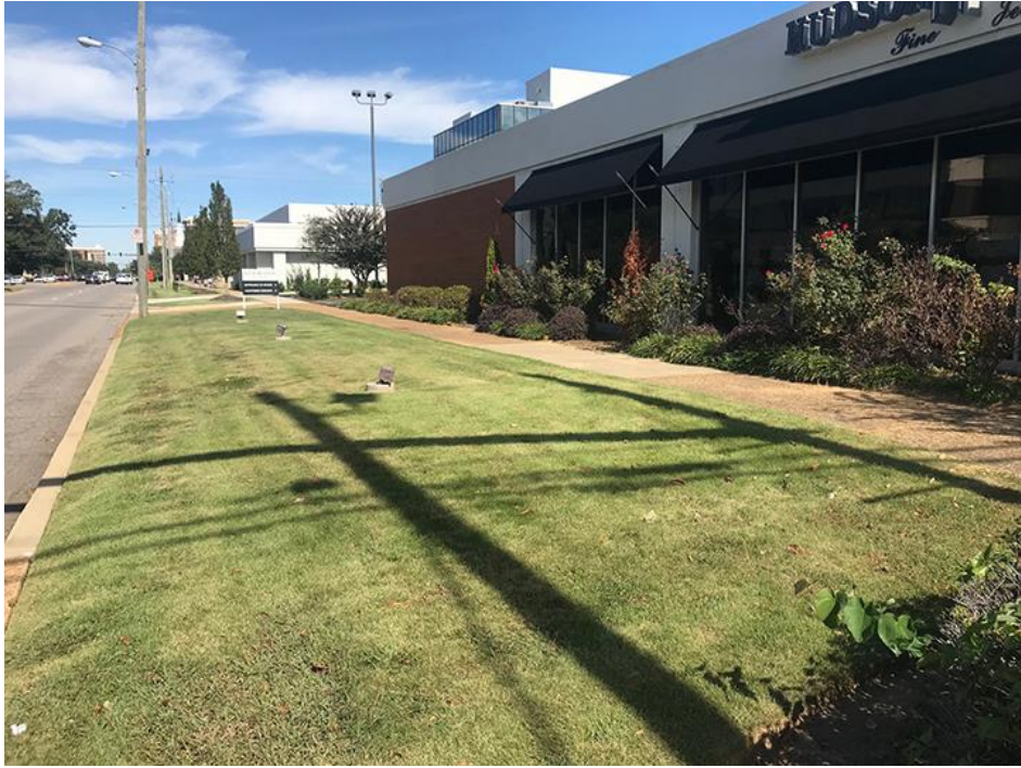
Ground site: looking north