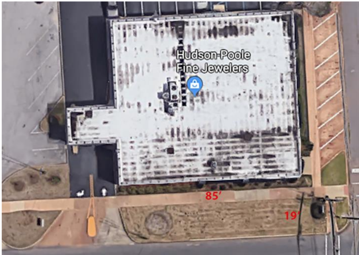
Site: ground dimension 85' length x 19' width