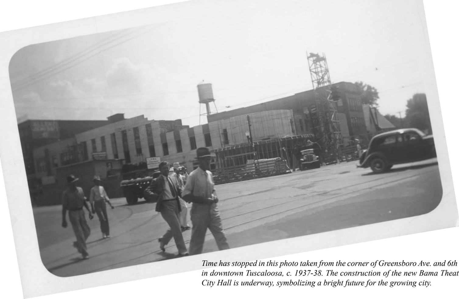
Time has stopped in this photo taken from the corner of Greensboro Ave. and 6th St. in downtown Tuscaloosa, c. 1937-38. The construction of the new Bama Theatre/City Hall is underway, symbolizing a bright future for the growing city.

“I realized right away that the material I’d be working with was not the traditional materials I’d been trained to use, but I was confident I could do the restoration and still maintain the integrity.” - Ruth O’Connor